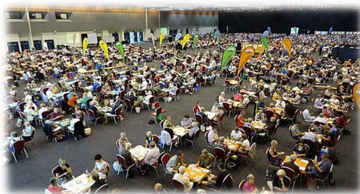
GCC: Largest bridge congress in the Southern Hemisphere

In this year's Congress, Peninsula was – as usual – represented by a sizeable contingent of players, some scoring impressive results.