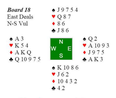
EW 6N; E 6♥; EW 6♦; EW 6♣; W 5♥; EW 2♠; Par -990

As with all sessions we had some good boards and some not so good ones We were under time pressure on one board and my partner after a few exploratory bids went 3NT. With 18pts opposite an opener I wondered if should I do a logical exploration for slam or just go for it. Tick, tock....I just went for it